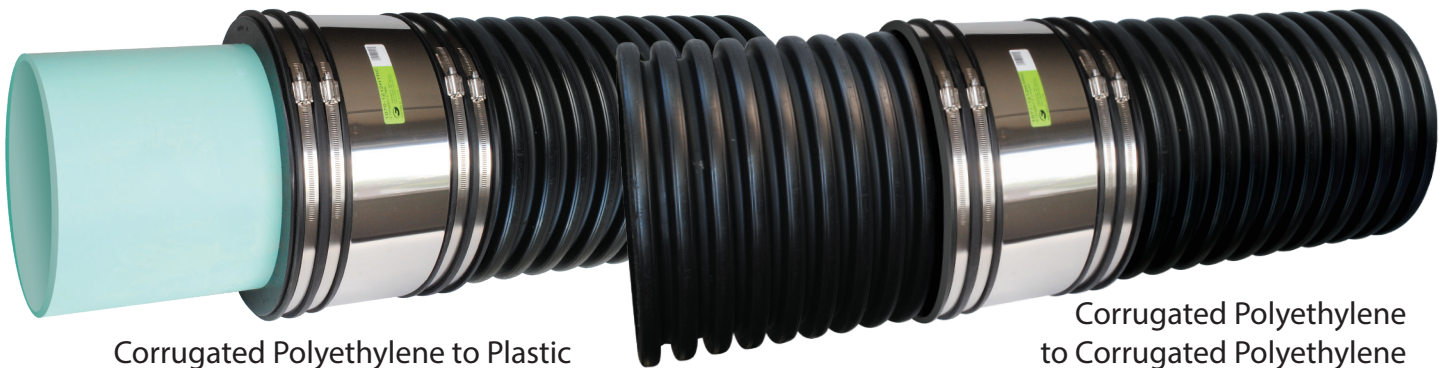
Corrugated Polyethylene to Plastic

Ultimate Sealing Gasket - The flexible PVC gasket has a smooth inside surface providing greater sealing performance than ribbed rubber gaskets. The smooth internal wall of the gasket makes contact 360° over its entire length. This equates to a larger sealing surface and a higher coefficient of friction, providing maximum sealing capabilities as well as preventing slippage under the weight of shear forces.