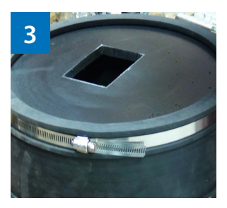
Cut out downspout area on connector