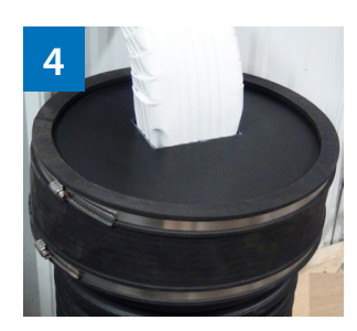
Fit downspout securely into connector

United States (810) 503-9000 fernco .com