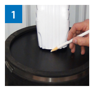
Trace downspout on connector